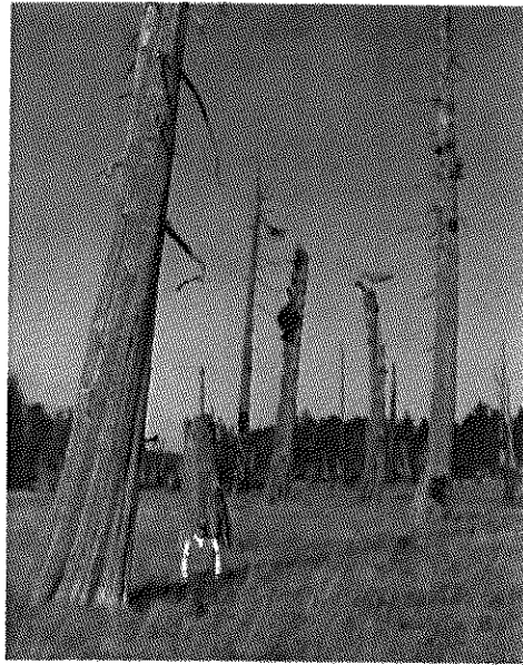
Scientists study dead trees along the coast in the Pacific Northwest. The trees are evidence that a large earthquake happened in January 1700.

American scientists tested the date and size that the Japanese scientists suggested. To do this, they went back to the trees that had been killed by the Cascadia earthquake. They measured the rings in the tree trunks to find the date each ring formed. This helped them figure out that the earthquake must have happened between August 1699 and May 1700. These dates supported the date suggested by the Japanese scientists. Together, all of these clues helped scientists learn the date and size of the 1700 Cascadia earthquake.